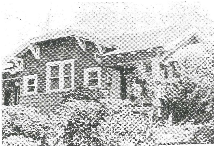
488 Larkin Valley Road (Present entrance)