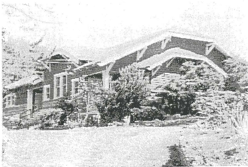
488 Larkin Valley Road (original entrance)